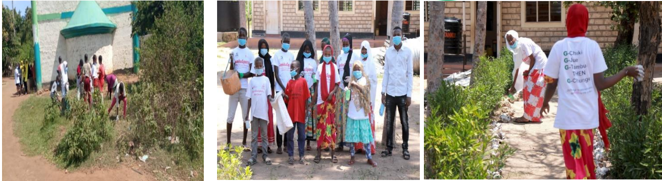
Figure 3,2,3 Shows the community services activities undertaken in Mkwakwani, Masindeni and Zigira pry school.