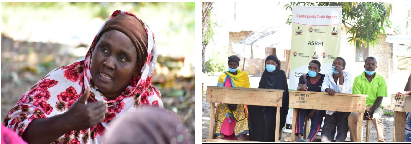
Figure 5, parents sharing their feedbacks, during parent dialogue meeting at Ramisi Markaz.