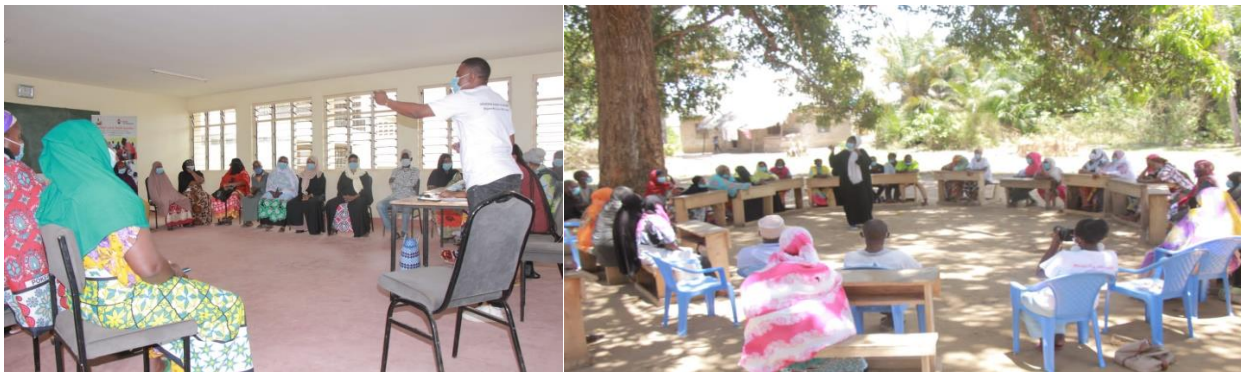
Figure. 1,2 ...Illustrating ongoing parent dialogue forum at Mkwakwani Pry school and Ramisi Village unit.

This engagement was designed for 3 hours open forum, open discussion, group works, group presentations, and plenary arguments which reflected on their basic understanding of the ASRHI-2 Project and its objectives, understanding their children, spotlighting the different and common parameters of parenting.