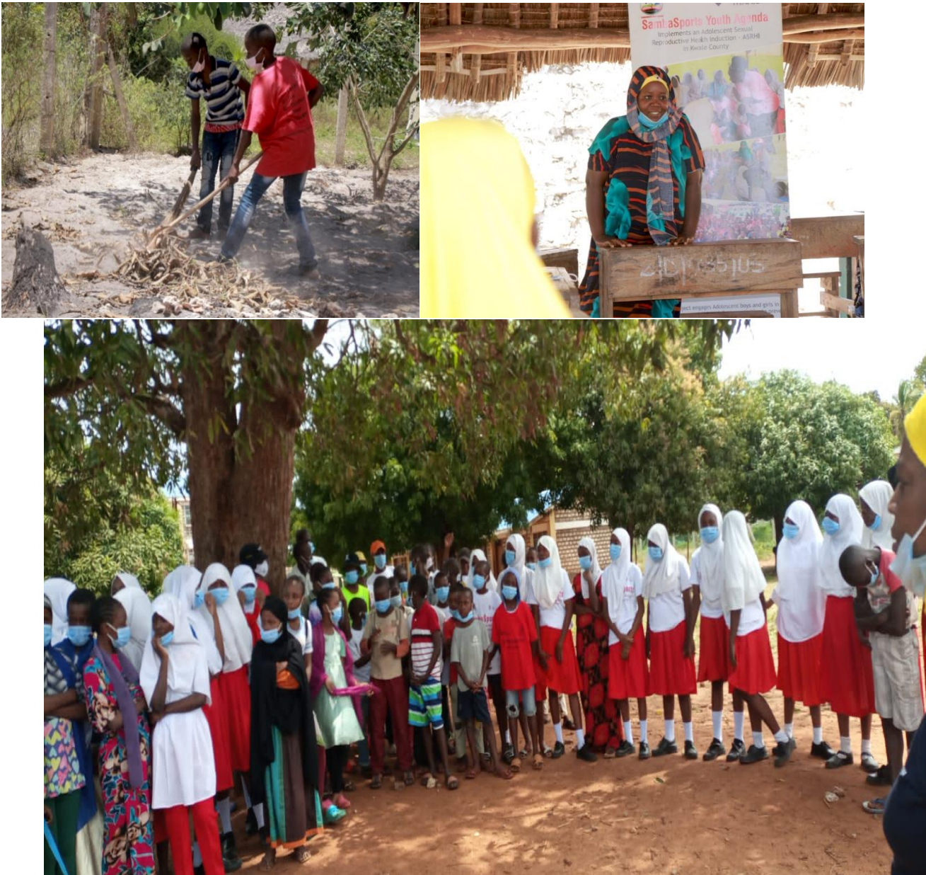
Figure 6. taken during the community services, a session done by one of SambaSports member at Mkwakwani Primary School.