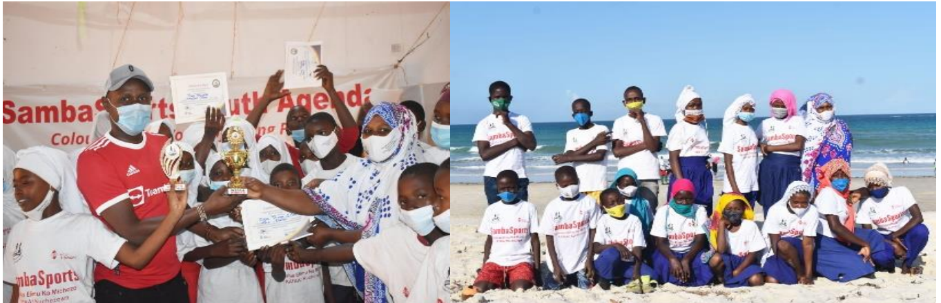
Figure 2,2 Shown the SambaSports youth Agenda partnership advisor awarding the winning team during the 3rd skits expo at Kwale Cultural Centre and exposure trip at Congo beach.

After the skits presentation, the 37 boys and girls were taken to Congo beach as an exposure trip, and this contributed greatly to their motivation, encouragement, increased self-awareness, self-expression and self-esteem in their lives as adolescents.