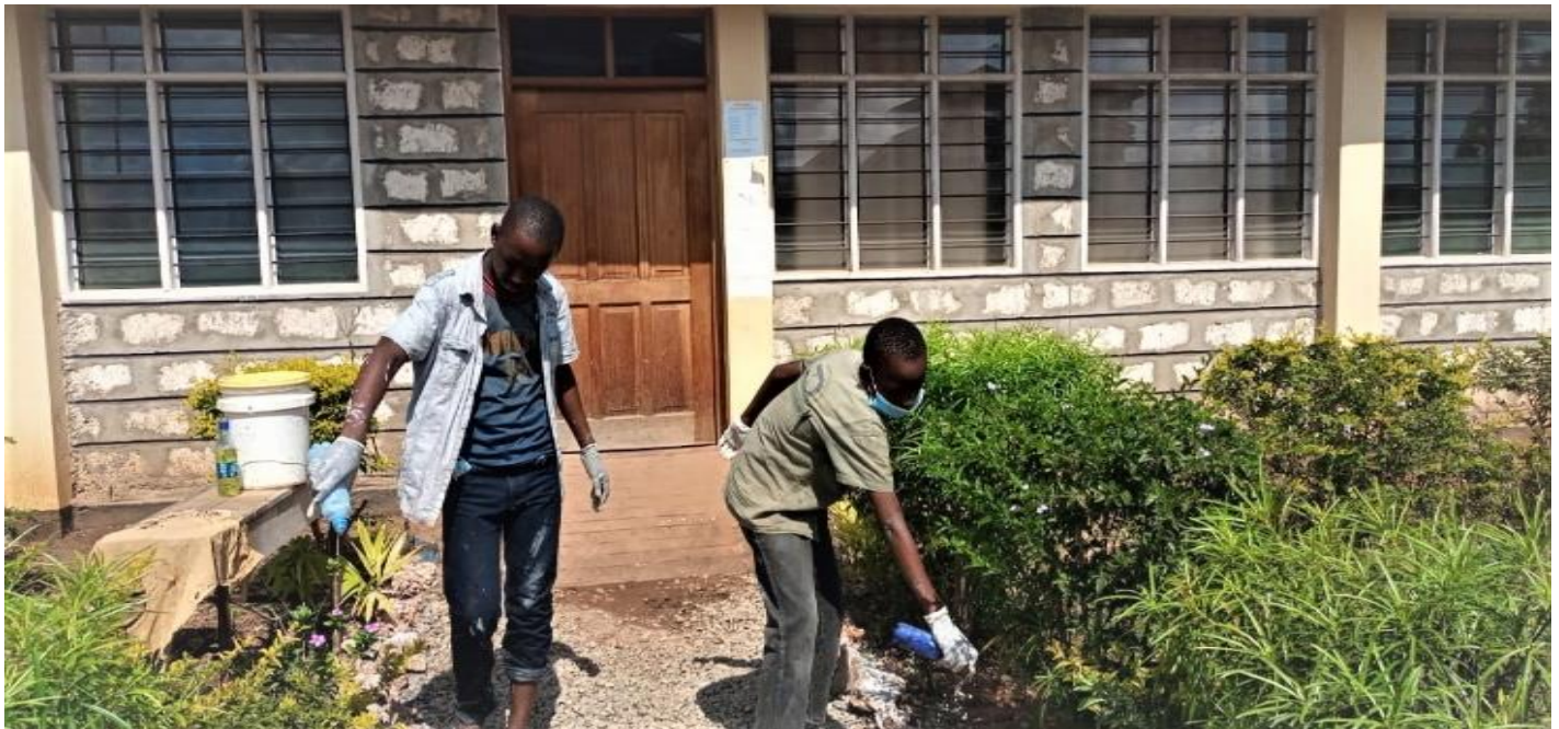
Figure 1. illustrating the adolescent boys coloring stones which demarcated on the footpath ways at school administration(Mkwakwani Primary School) during the ASRHI-2 community service activity for the positively influenced adolescent boys and girls.